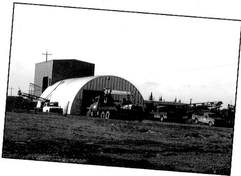
Shabogamo Mining & Exploration Limited's new crushing and screening facility at Wabush.