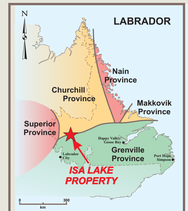
Map 1: Property location map

Little previous work has been carried out in the area. Gallery Resources worked as the operator for an option in the early 2000's with BHP Billiton exploring for magmatic Ni-Cu-Co mineralization, particularly in the Shabogamo Gabbro (French and Mugford, 2006). The present owners have made a new discovery of coarse grained graphite with grabs returning up to 15.65% graphite (Plate 1). Although detailed mapping is not available for this area, examination of the 100,000 regional mapping (Wardle, 1985) indicates that the area is probably underlain by rocks of the McKay Formation. The high grade metamorphic character of the host rocks and regional (potential) economic graphite occurrences suggest that the new Isa Lake showing has significant economic potential for coarse-grained graphite.