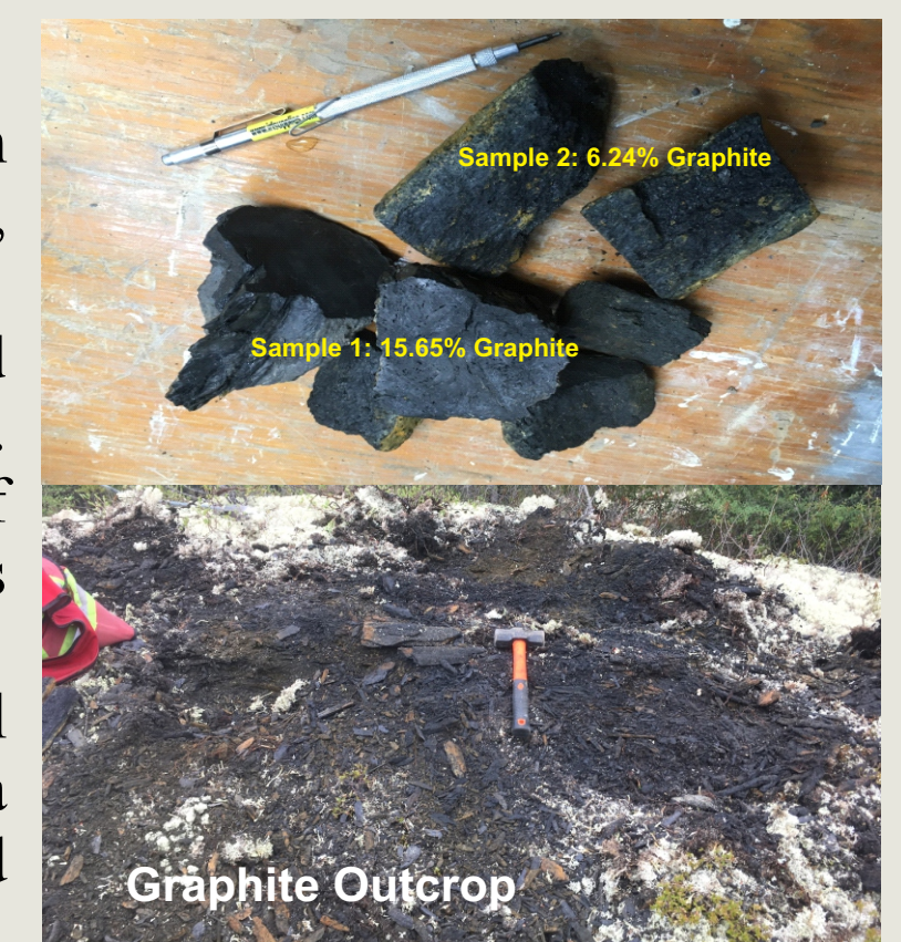
Plate 1. Isa Lake Graphite