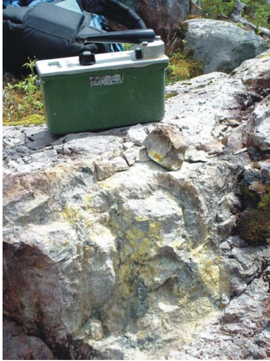
Scintillometer and secondary uranium minerals Burnt Emben Prospect, Labrador.

similar to autunite and torbernite. At least two of these three minerals are almost always found together, in proportions varying with availability of copper and phosphorus; uranophane is predominant where these two elements are scarce or absent. It is the most common secondary uranium mineral found in the noncommercial deposits in granite and pegmatites in the eastern United States.