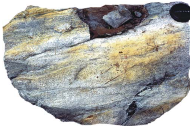
Secondary uranium mineral stain White Bear River area, Hermitage Flexure - Southern Newfoundland