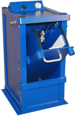
Example of a class 2 refill station.

CSA Z180 1-13, Compressed Breathing Air and Systems, contains the requirements for fill stations. A Class 2 fill station would meet these requirements. A Class 4 would not. FES-NL and Service NL recommends a Class 2 refill station, however a class 4 fill station would be considered as acceptable subject to meeting specific conditions.