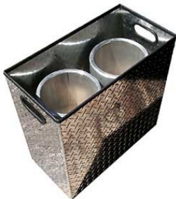
Example of a class 4 refill station.